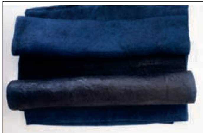
Below, Fermented indigo on vintage silk, treated with eggwhite.