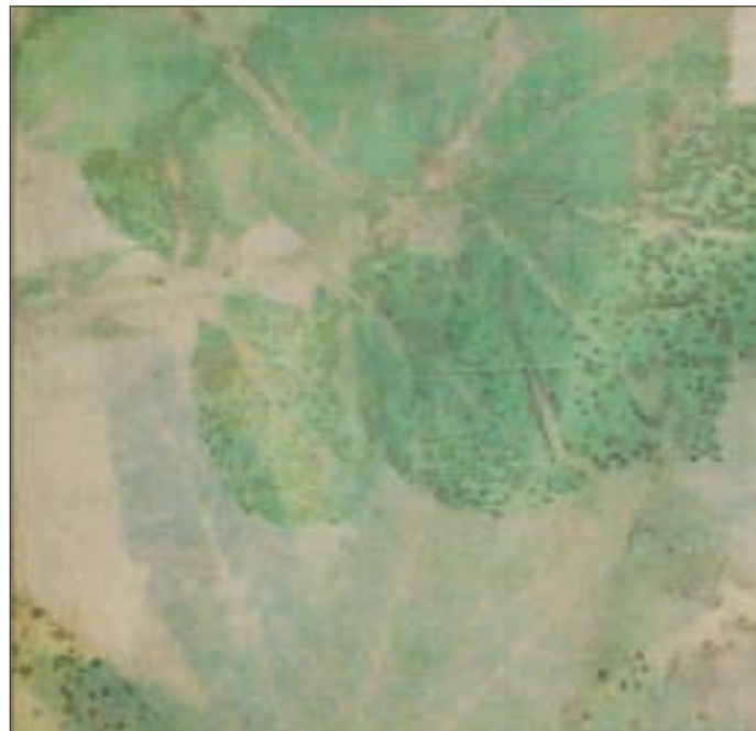
Left page, Window: Leaves are laid on a cloth, the patterning emerging with the aid of the dyestuff and tannins in the foliage. Plant-dyed and waxed cloth shaped and stitched with the tiniest of stitches.

The dye course, where she demonstrated her way of working, was held in another building alongside the show. Many of the